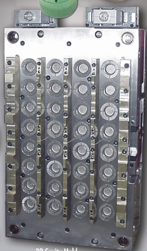
32 Cavity Mold 28 mm Tamper Evident Closure Mold Fits a 90 ton machine