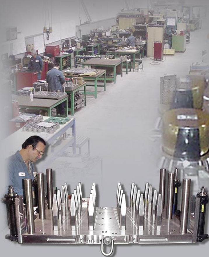
24 Cavity 5 Piece Collapsing Core Mold